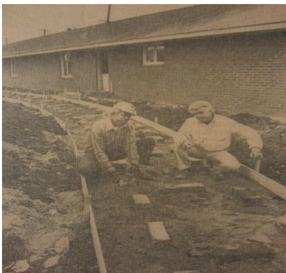
St. Mary's building construction